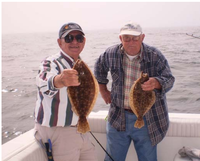
Two Happy Fishermen